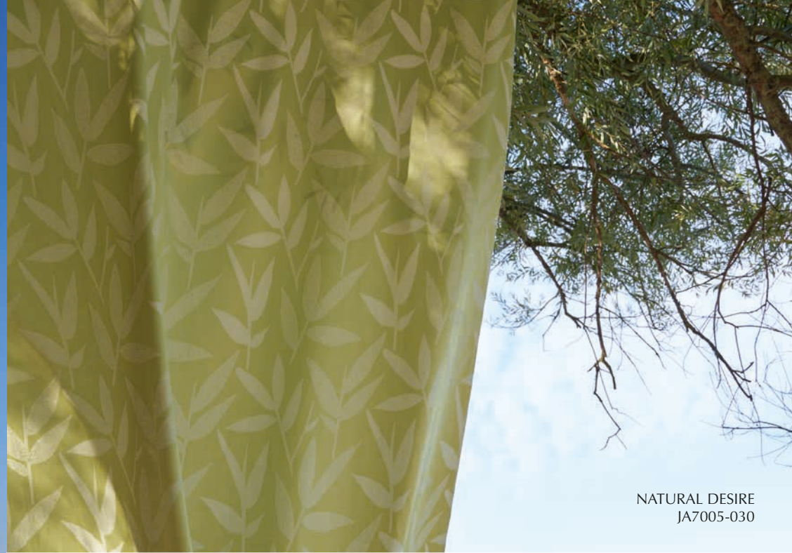
NATURAL DESIRE JA7005-030